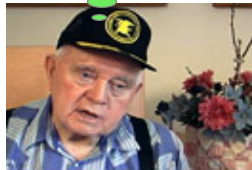
"Being a Grandfather"