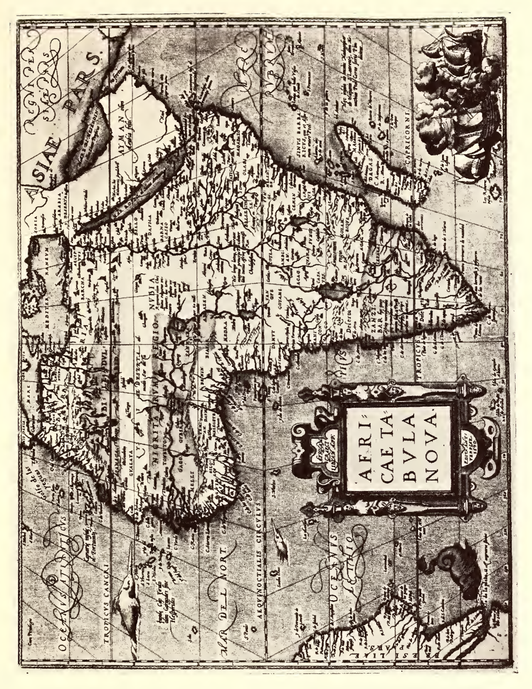
MAP OF AFRICA From Ortelius: Theatrum Orbis Terrarum, 1584